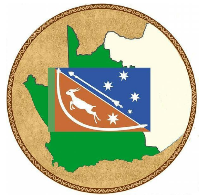
For Further Information www.sovereignstateofgoodhope.net www.sovereignstateofgoodhope.org www.usaf.org.za